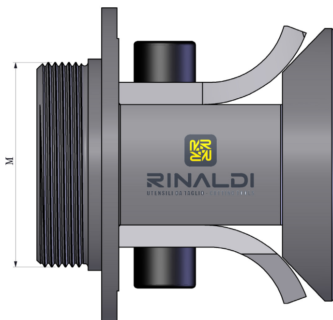
COLTELLI TRAFILA " CPT-55100 "